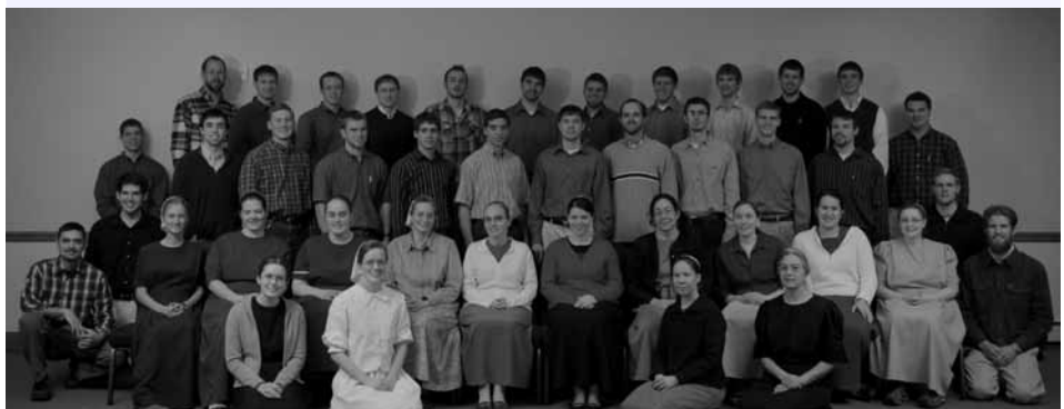
five-week students for Winter Term

We welcome alumni news to print in our newsletter. Please email your news to fbep@fbep.org . We'll be glad to include it in the next newsletter.